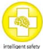
intelligent safety system (iss)

Ramping speed up and down at the start and end of each cycle reduces stress on the gate and opener for longer life, and makes for quieter operation.